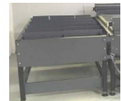
Extension Sheet Support (optional)