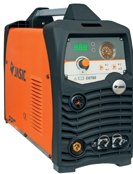
Jasic Plasma Cut 60