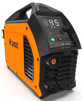
Jasic Evo Plasma Cut 45

For optimum cutting performance, we have partnered the Pro-Cut Table with the Jasic Inverter Plasma Cutting Machines. We offer a choice of 4 Jasic Plasma cutters with a table cutting capacity of up to 22mm to ensure you get the right Plasma machine to suit your needs. With proven reliability, performance and backed up by a 5 year warranty we guarantee peace of mind cutting.