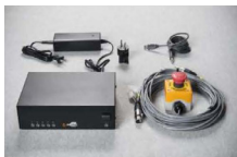
Electronic Control Unit and Cables

Jasic EP-45 Jasic JP-61 Jasic JP-81 Jasic JP-101