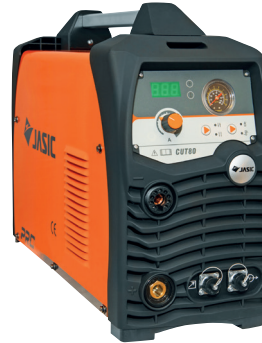
Jasic Plasma Cut 80