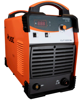
Jasic Plasma Cut 101