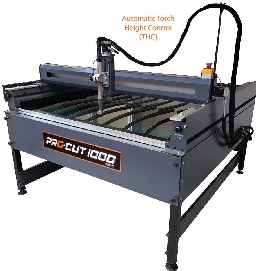
Automatic Torch Height Control (THC)

Our Torch Height Control system adjusts the torch height thousands of times per second to maintain a precise distance between the plasma torch tip and material being cut, ensuring on thinner material which are warped you will still experience smooth edges, sharp detail and precision cuts.